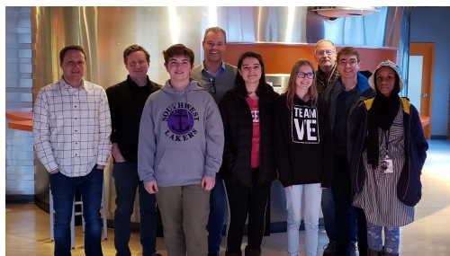
The marketing sub-team at the advertising firm.

The electrical sub-team, in collaboration with the build team, put the power distribution panel in, (also known as the PDP) some motor controllers, along with some other electronic bits and bobs.