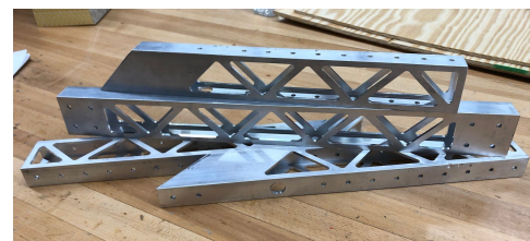
Bumper supports machined on the router

The router has been very busy this week machining aluminum into a variety of parts. On the right and below you can see examples of two parts we have machined, bumper supports and gussets.