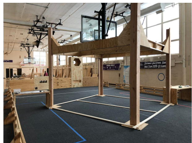
The progress so far at MURA field.

Over the long weekend, we made tremendous progress towards completing the practice field at MURA in collaboration with other FRC teams. Ultraviolet, Herobotics, Green Machine, and the MinuteBots completed the power port (the hexagonal hole in the back of the field in the photo), the Loading Bay (the three small squares to the left of the